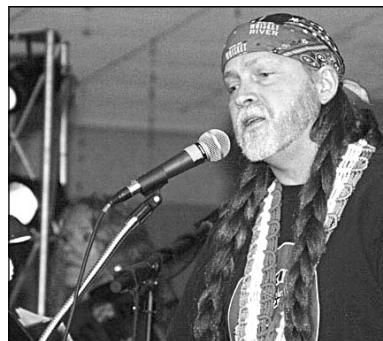
A tribute to Willie Nelson is planned.