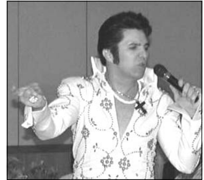
"The King" was one of several entertainers from Salute to the Superstars who got the crowd moving at the Macomb County Warming Center annual dinner this year.

The shows will begin in January 2010 and continue throughout the year. Twelve shows have been scheduled and some will be