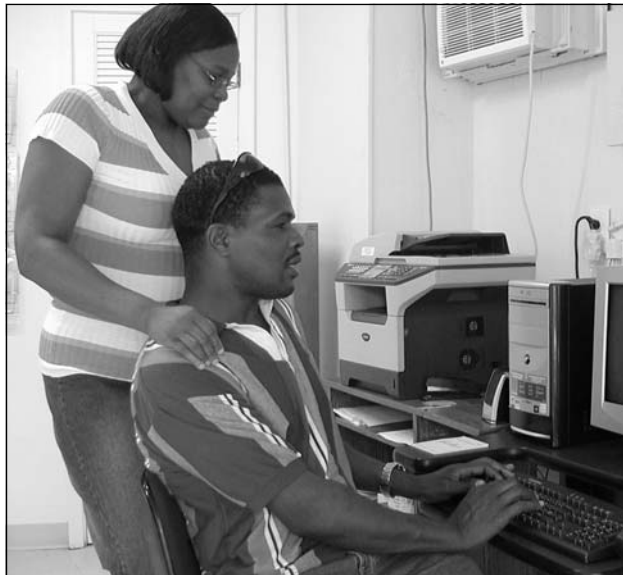
Two members of a Peer Support Group use the computer at the Ray of Hope Day Center.

Those accepted in the Peer Support program must show that they are committed to changing their situation. They are required to attend a weekly meeting at the Ray of