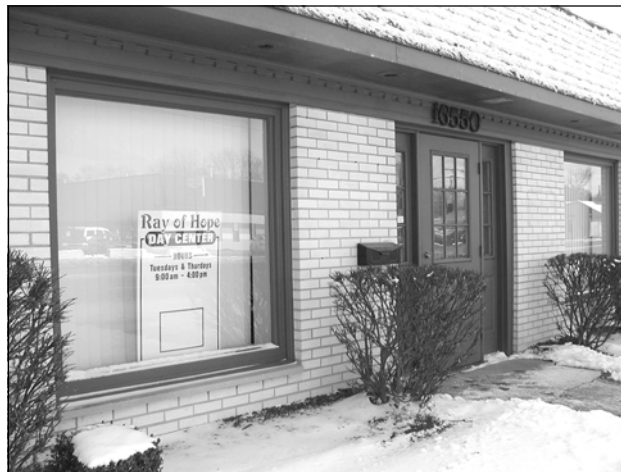
The new location is on the south side of Nine Mile Road, just east of Gratiot in Eastpointe.

medical, dental and mental health referrals as well as access to substance abuse treatment.